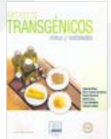
Transgenic Foods: Myths and Realities