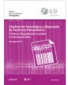
Toxicological Classification and Labeling Criteria for Crop Protection Products