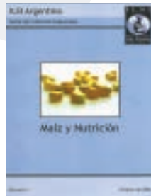
Maize and Nutrition Special Report