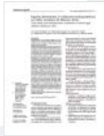
Food Intake and Anthropometric Evaluation in School-aged Children of Buenos Aires