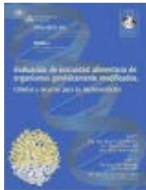
Safety Evaluation of GMOs. Criteria and resources for its implementations