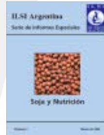
Soybean and Nutrition Special Report