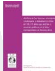
Analysis of the factors associated to overweight and obesity in a group of 10-11 year old schoolchildren in B.A.